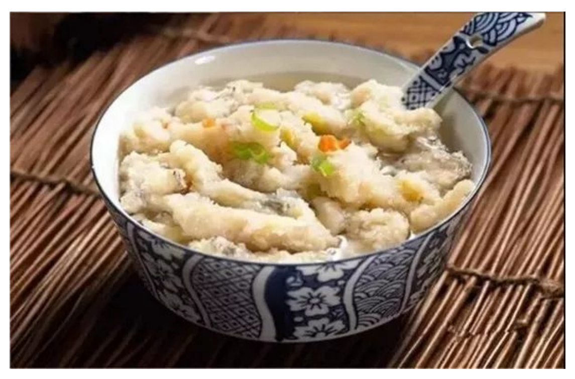
Pork Ribs Noodle

This is a good choice for safe player if you are not ready for unknown local food.