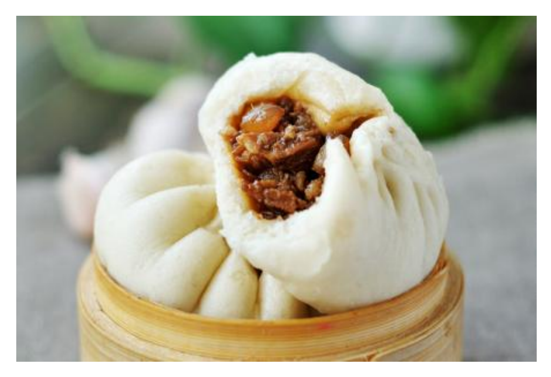
Qingjiang Three Seafood Noodle

The seafood noodle is so fresh that you won't fell the fishy smell of the seafood. And don't forget to drink the soup.