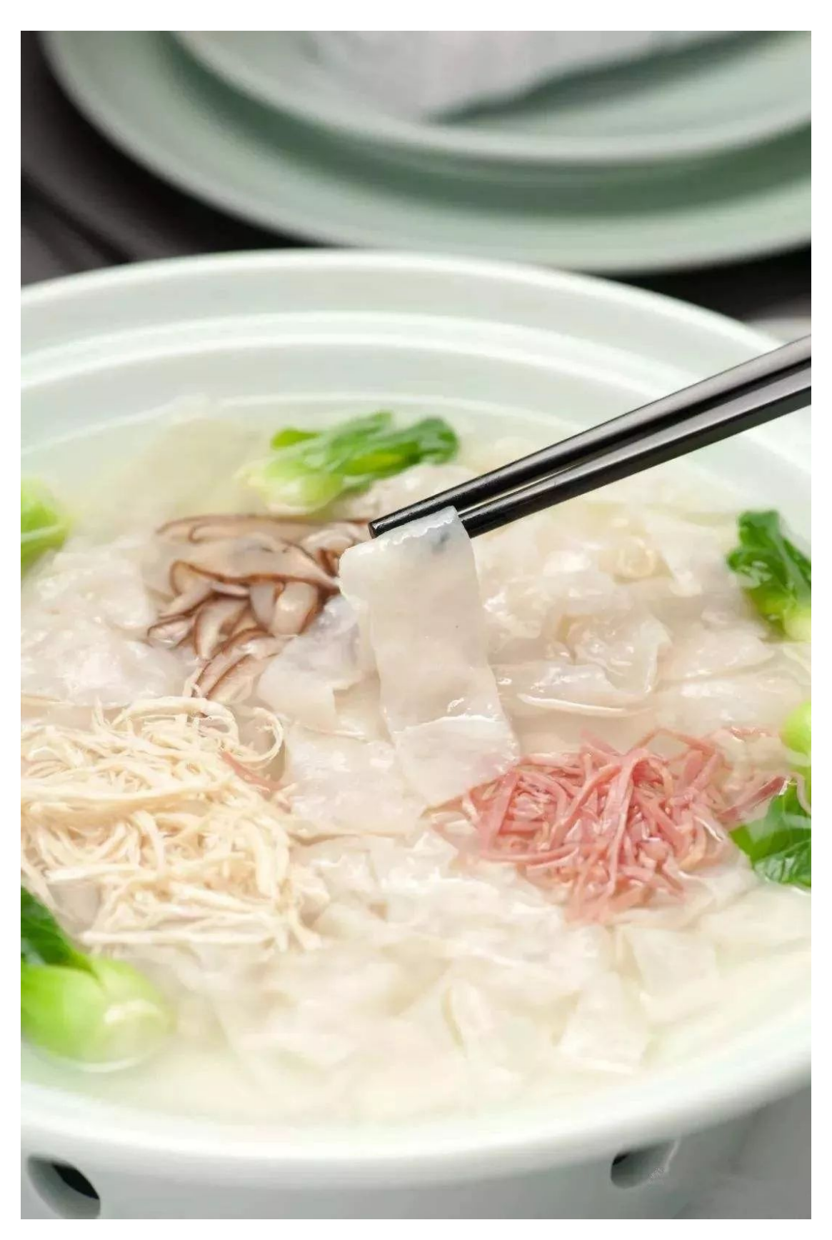
Tangyuan (Sweet dumplings)

This is a good choice for sweet tooth. Inside of the Tangyuan, there is sesame.