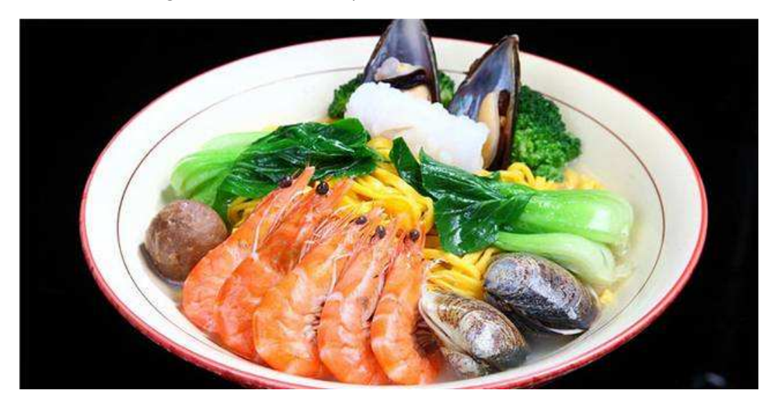
Lunch 11:00-13:00 PM

The seafood noodle is so fresh that you won't fell the fishy smell of the seafood. And don't forget to drink the soup.